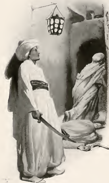
The fourth, seeing what had happened, fled. (P. 312.)

Half an hour passed before he heard steps coming from the direction of the Bazaar. The robber must have heard them also, for he slunk past Said towards the Bazaar. The steps came nearer and Said could just recognise some dark forms, when the robber clapped his hands softly and the same moment the three in the background darted forward. Those attacked must have